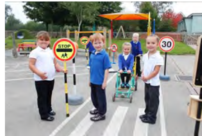
Children from Athelstan Community Primary School are using role play to learn about keeping safe on the roads.

So when you are out and about this winter take care, and remember to not only keep yourself safe on the roads, but like the children at Athelstan Primary School think about the consequences your actions may have on other road users.