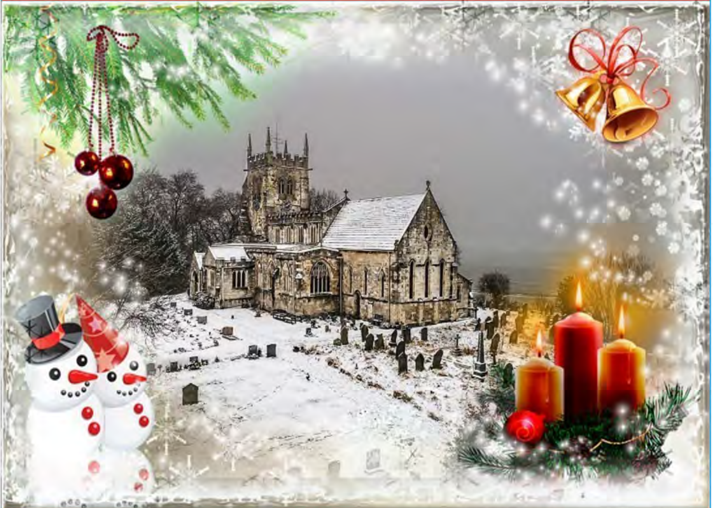
Photograph of All Saints' Church

WISHING ALL OUR READERS A VERY MERRY CHRISTMAS AND A HAPPY AND HEALTHY NEW YEAR.